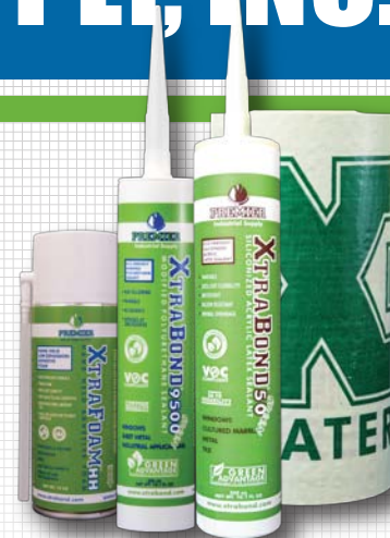
FOAM, SEALANT AND FLASHING PRODUCTS