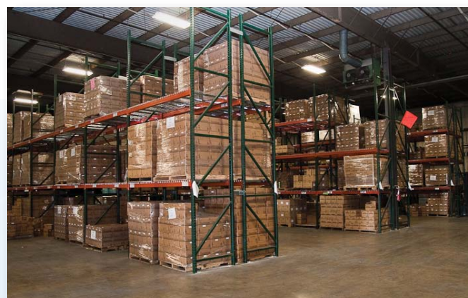
STOCKED WAREHOUSES BOTH EAST & WEST COASTS